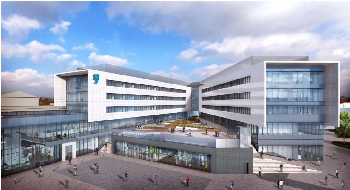
Picture 1: Position of Tameside Council and Tameside College's logos